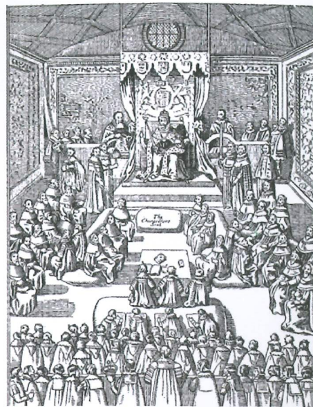
Figure 1.3: James VI and I in Parliament. This print by Reginald Elstrack was published in 1608.

For much of his reign, James VI and I had pursued a peaceful foreign policy. James maintained peaceful relations with Spain by discussing the possibility of a marriage between his son, Prince Henry, and the Spanish Infanta. The so-called Spanish Match was even kept alive after Prince Henry's untimely death in 1612 by his brother, Prince Charles. Although the marriage was never settled, and was highly unpopular within Protestant England, James did well to use it as a means of maintaining peaceable diplomacy with Europe's greatest power. This relationship with Catholic Spain was balanced by his daughter Elizabeth's marriage to the Protestant Prince Frederick, Elector of the Palatinate (a German territory). In 1618, however, the peace of Europe was shattered when European Catholics and Protestants became embroiled in the Thirty Years' War (1618–48). James could only resist involvement for so long. Facing Parliamentary pressure, in 1624 he finally relented and sent an army to assist his daughter Elizabeth and his son-in-law, Frederick, reclaim their realm. The same year, Buckingham and Prince Charles had attempted a disastrous surprise visit to the Spanish Infanta in Madrid. The fiasco that this caused turned both men against the Spanish Match and ensured they supported Parliament's calls for war. By his death in 1625, James's kingdoms were once again at war with Spain.