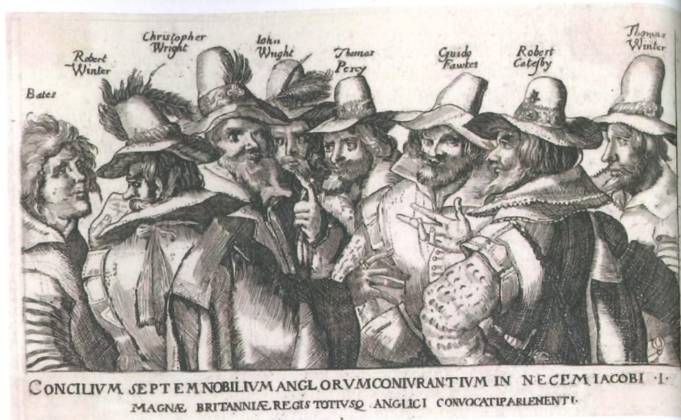
Figure 1.1: An engraving showing the Catholic conspirators responsible for the Gunpowder Plot in 1605. The idea of a Catholic conspiracy haunted the minds of English Protestants.