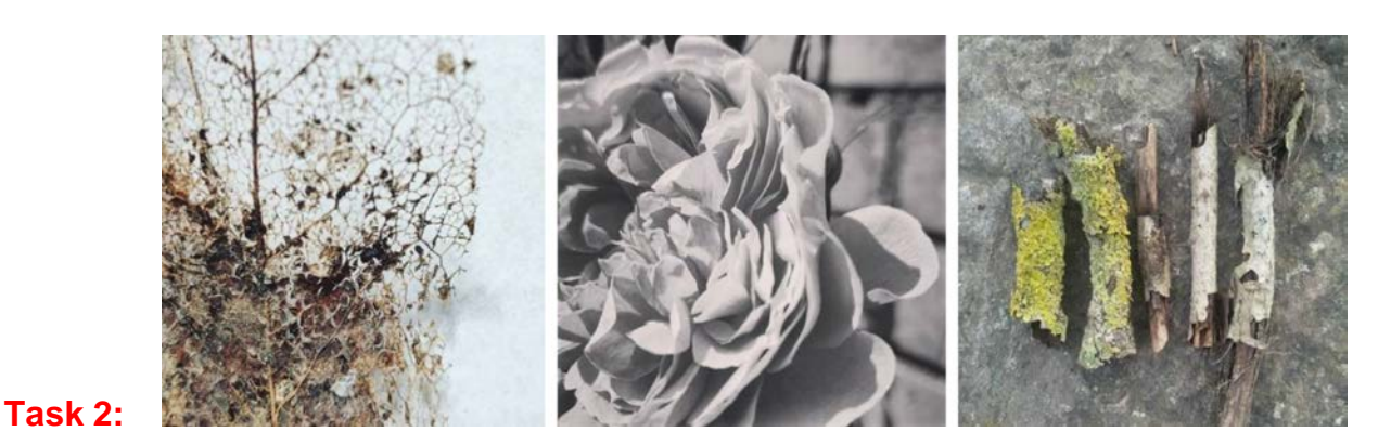
Take 12 high quality photos of interesting structures, surfaces and forms in nature. Be inspired by your local environment or visit a botanical garden/research centre/aquarium/natural history museum etc.

Compile a list of 10 artists or designers who really inspire you from looking at the above websites/galleries/resources. They can inspire you in many ways, for example, through their choice of materials, craftsmanship/techniques they use, a specific design they have created or perhaps an innovative development they have made. This will allow me to get an insight into the type of work you like.