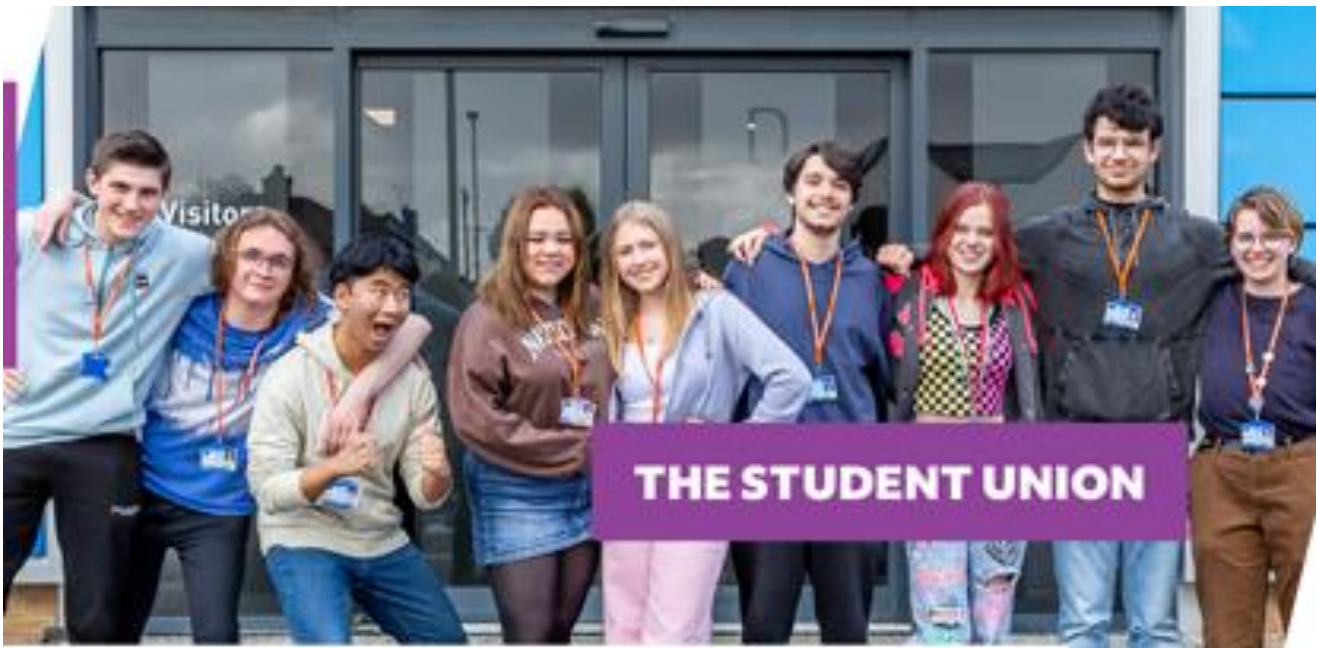
2023-24 Student Union